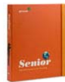
Girl's Guide to Girl Scouting