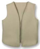
Official Girl Scout Senior Vest