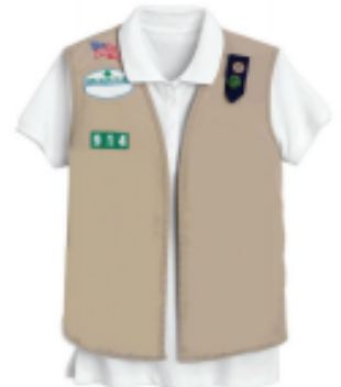
CADETTE, SENIOR, AMBASSADOR: 6TH-12TH GRADE