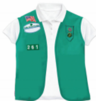
JUNIOR: 4TH-5TH GRADE