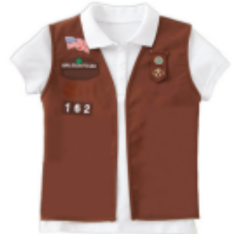
BROWNIE: 2ND-3RD GRADE