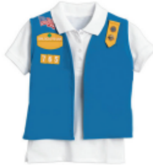
DAISY: K-1ST GRADE